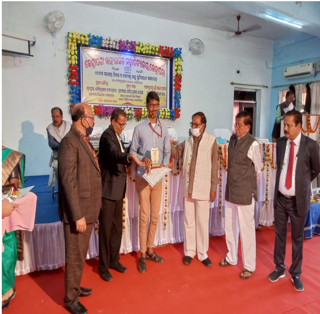
Best graduate Award (Dept. of Physics) Pass out batch-2021