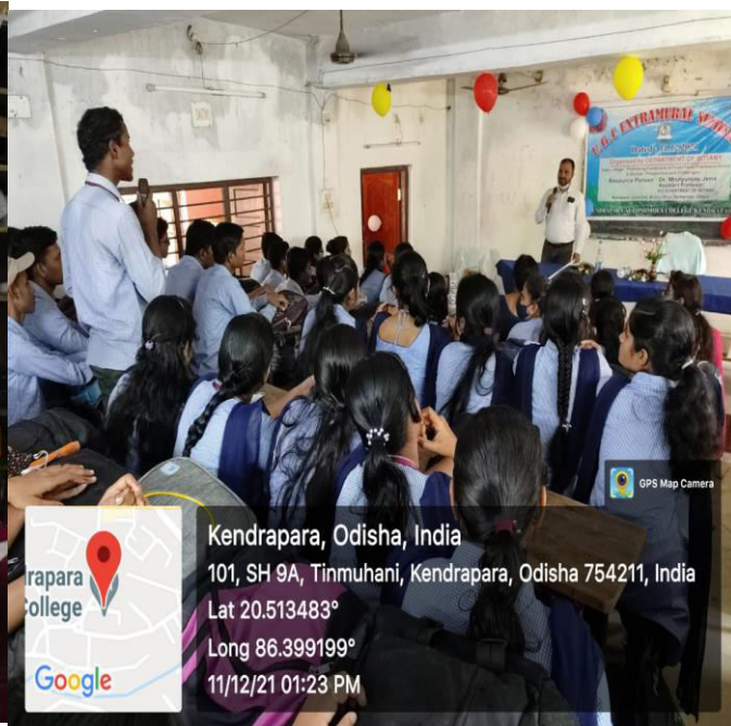
Extramural seminars of Different departments