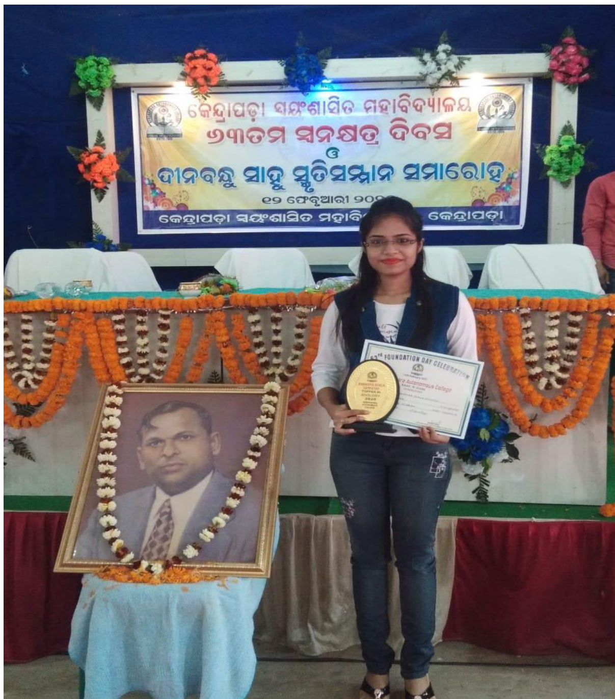
Award to Zoology topper (pass out batch-2020)