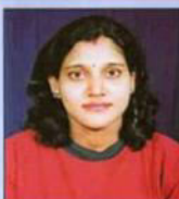
Dinabandhu Sahu Memorial Award 2021