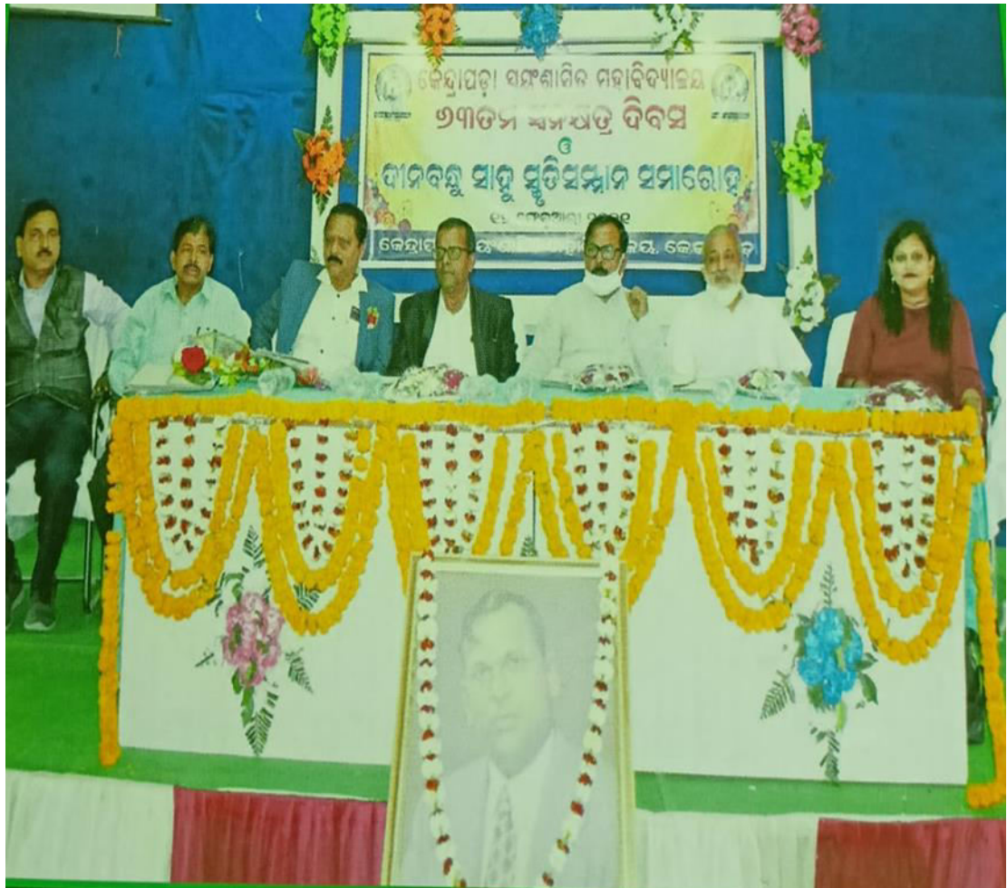
Dinabandhu Sahoo Smruti Samman-2021