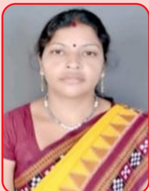
Dinabandhu Sahu Memorial Award 2023