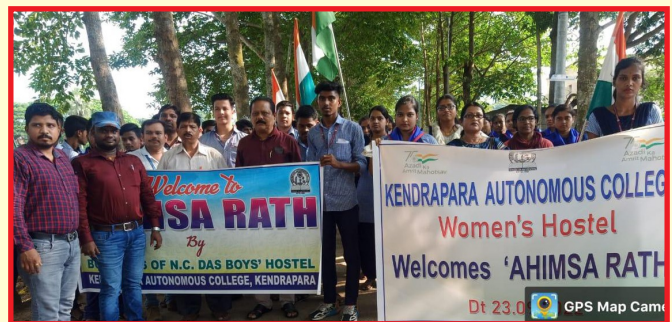
Welcome to "AHIMSA RATH" by NSS volunteers