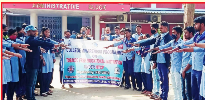
College awareness programme on "Tobacco free educational institution under NTCP" by NSS